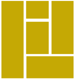
FIGURE 1. Characteristics of Retirees by Year of First Entitlement